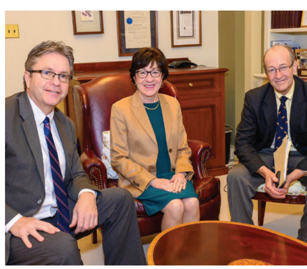
Meeting with U.S. Senator Susan Collins across the hall from her committee duties

2 Portland Square, 5th Floor | Portland, ME 04101 (207) 775-2990 | (800) 341-0336 | www.jmjrbc.com